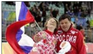
Russian gold medalists celebrate their victories at Winter Olympics in Turin