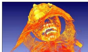
Virtual autopsy of Egyptian mummy

Prophet Muhammad cartoons trigger massive protests of Muslims globally